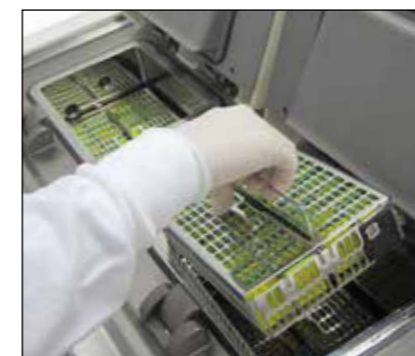
Dual Retorts for continuous processing