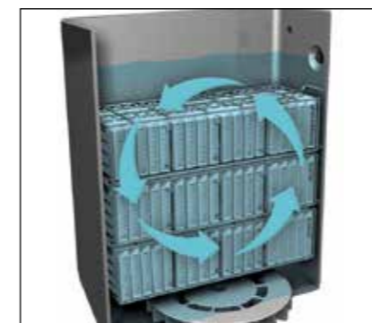
ActivFlo for rapid reagent flow