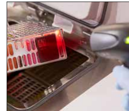
Track and Trace for increased traceability