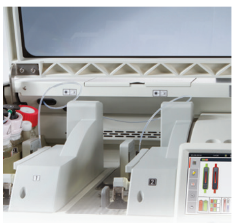
The first and only workstation in the market with dual glass coverslip lines enabling the highest throughput of up to 570 dried slides per hour.