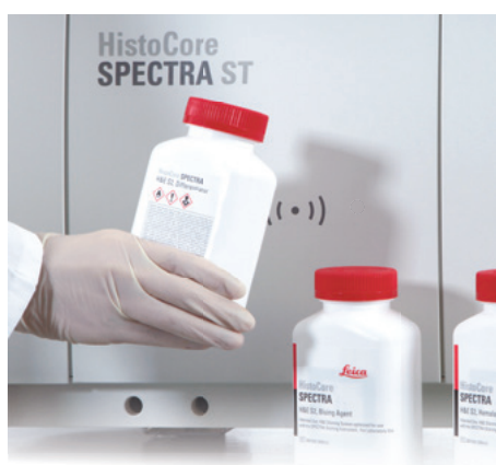
Reduce reagent consumption and effort with RFID and single slide counter.