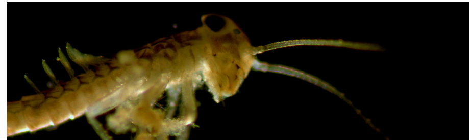
The outstanding contrast of the Leica DMC4500 on the example of an ephemera larva