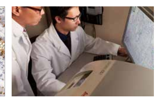
Review difficult cases with peers or collaborate globally

Slides are on the Aperio eSlide tray in <90 seconds